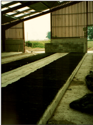
FIGURE 1. Lay out the mattresses with a nice tidy edge.