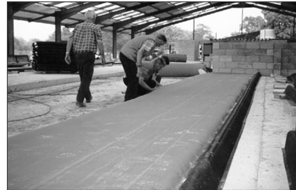
FIGURE 6. Tuck the top cover under the mattresses as tight as possible.