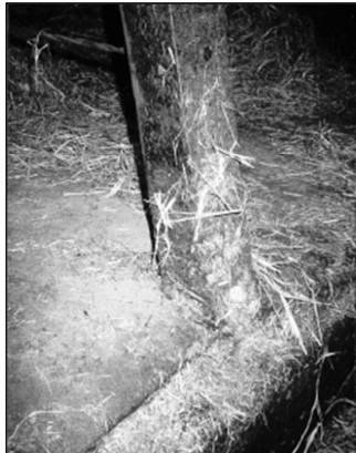
FIGURE 8. (left) Top cover cut around the back leg. FIGURE 9. (below) Pasture Mat installed into kennels

Where the obstruction is in the middle of the stall, the top cover will need joining. This is no problem, and the join will be as good as the rest of the top cover, however specialist tools are required and you will need to consult with your supplier.