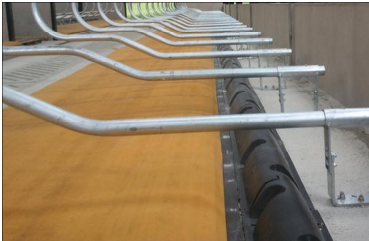
FIGURE 5. Pasture Mat mattresses installed with moovApillow (NOTE: sometimes the MoovApillow will overlap the plastic strips)