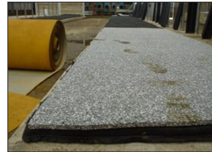
FIGURE 3. Optional Premium Pad foam on top of the Pasture Mat mattresses