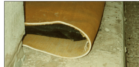
FIGURE 7. Top cover tucked under the mattresses.