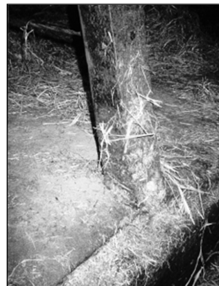
FIGURE 8. (left) Top cover cut around the back leg. FIGURE 9. (below) Pasture Mat installed into kennels

Where the obstruction is in the middle of the stall, the top cover will need joining. This is no problem, and the join will be as good as the rest of the top cover, however specialist tools are required and you will need to consult with your supplier.