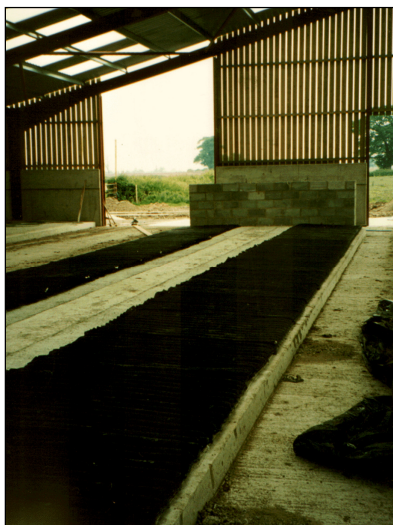
FIGURE 1. Lay out the mattresses with a nice tidy edge.