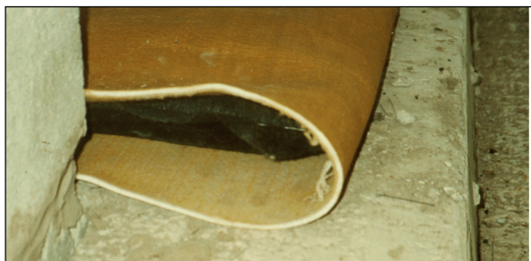
FIGURE 7. Top cover tucked under the mattresses.