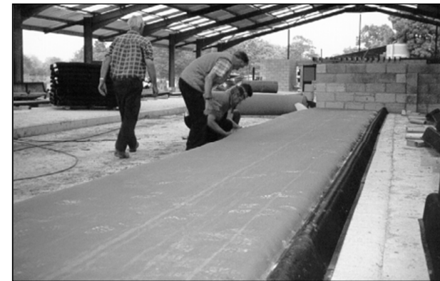
FIGURE 6. Tuck the top cover under the mattresses as tight as possible.